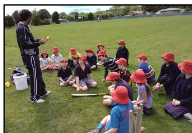
Rm4 students participating in a training session with a Southland Cricket coach on 24 October.

On Wednesday, students from our yr7/8 cohort participated at the SMAC Math competition at James Hargest Senior Campus in Invercargill.