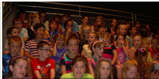
Kids For Kids